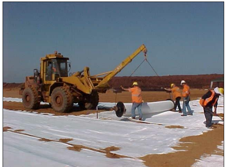
Figure 9 Laying Basetex geotextile using a Lifting Beam Set

Fill should be spread in layers of not less than 150mm finished thickness directly on top of the Basetex to protect it from damage. Care should be taken to avoid damage to the Basetex. No traffic or site plant shall be permitted to travel over the Basetex prior to placing fill on it.