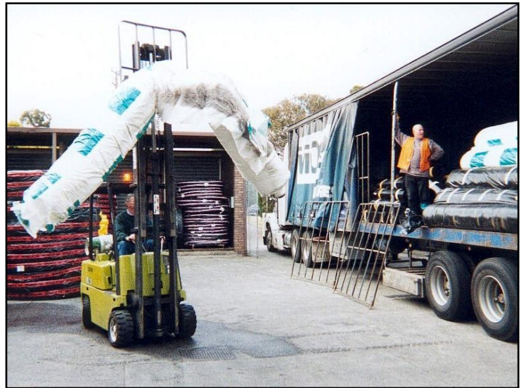
Figure 3 Incorrect method of lifting – must not be used

Rolls are normally unloaded from the container or truck using a steel carpet pole, fixed to a forklift truck, as shown on Figure 2. Due to the weight and flexibility of the rolls, it is not recommended to lift using straps around the end of the rolls or lift from the mid roll length (Figure 3). The use of straps is also a potential safety hazard and in addition, if the core is broken or distorted, proper installation and on-site handling of the Basetex rolls will be difficult.