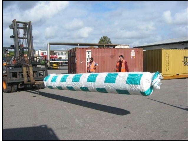
Figure 2 Extracting rolls from container with forklift fitted with a 4m carpet pole