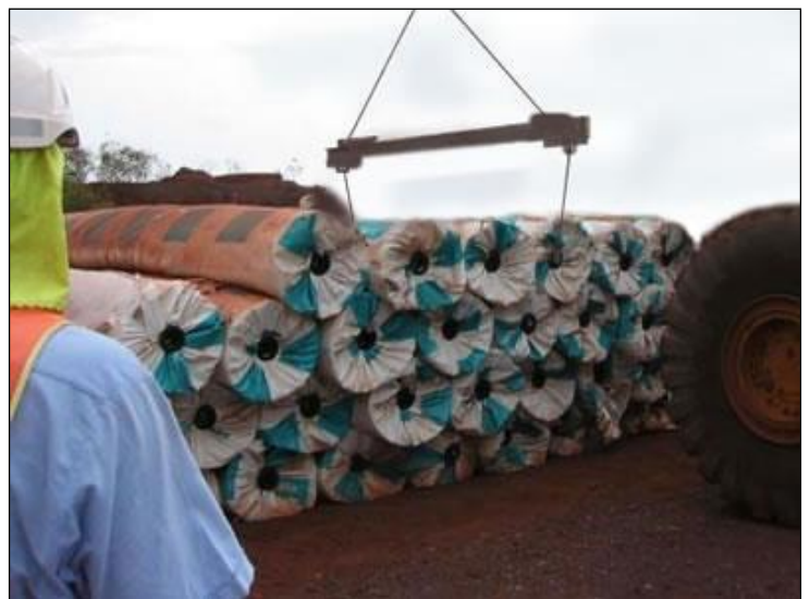
Figure 4 Tensar Basetex rolls stacked on site (Max 4 rolls high)

Basetex rolls should be temporarily stored either on a timber platform or prepared ground, to keep the roll cores straight to facilitate later lifting (Figure 4). They should be stacked no more than 4 rolls high.